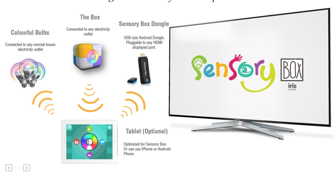
Figure 2: Sensory Box Components

that is used to interact with all the equipment. This product minimizes the need for physical labor for installation and it is very user-friendly.